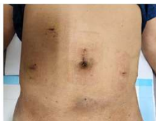
Scars after robotic prostatectomy